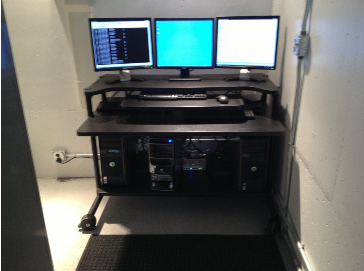
PIT tag system data collection computer platform at TD2