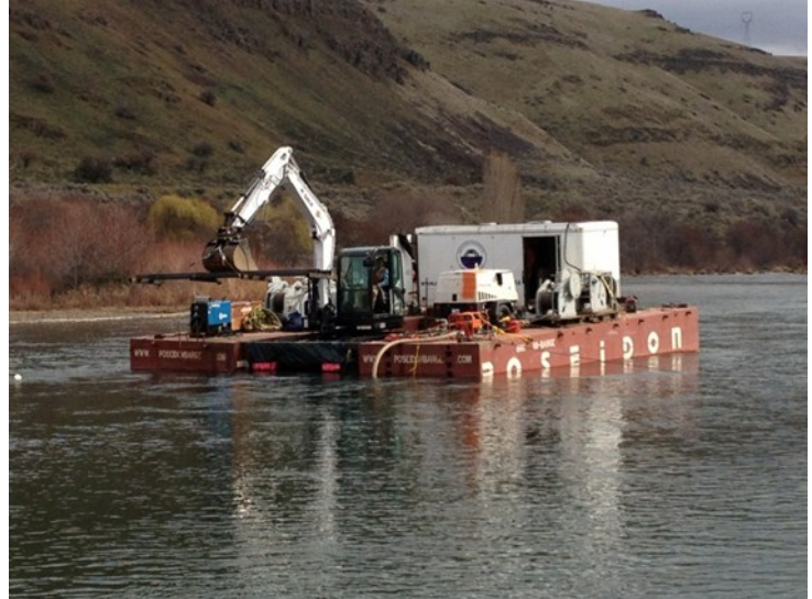
The work platform in the Deschutes River with Biomark 20' stout antenna secured to the excavator shovel ready for submersion and placement.

The Confederated Tribes of Warm Springs (CTWS), with funding from the Bonneville Power Administration, installed a PIT-tag detection system near the confluence of the Deschutes and Columbia rivers. The system began interrogating on 14 March, 2013. The antenna array is expected to be a very useful tool for determining straying rates of adult steelhead Oncorhynchus mykiss and fall Chinook O. tshawytscha returning to spawn, timing and number of migrating bull trout Salvelinus confluentus and sockeye O. nerka from/to the middle Deschutes River, and it may allow an alternative method or means to validate abundance estimates of Pacific lamprey Entosphenus tridentatus .