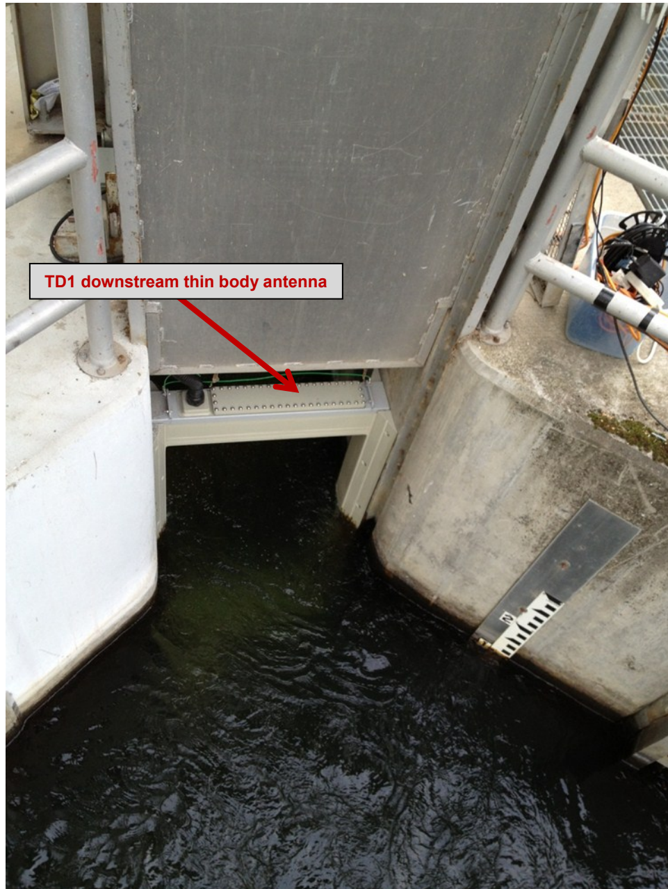
TD1 downstream thin body antenna

The Dalles adult ladders are now equipped with thin body ferrite tile PIT tag antennas. The goal of these antennas is a detection rate of near 100% and an uptime of near 100%. The first detections at the dam have resulted in each antenna reading each tag 10+ times, which is an indication of a very robust detection system. The antenna systems were operational prior to water up at each ladder with the east ladder watering up on 2/12/2013 and the north ladder watering up on 3/11/2013.