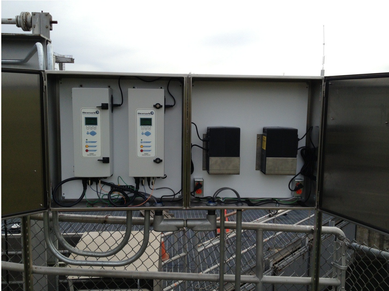
PIT tag stationary readers at TD2

The future for thin body antennas is bright. Future U.S. Army Corps of Engineers (USACE) projects include antennas for the Little Goose adult ladder, both adult ladders at Lower Monumental and a single antenna at the Ice Harbor adult fish trap. The single antenna at Ice Harbor will provide for a separation-by-code system to target specific fish for trapping and transport. Other possible projects being discussed are both adult ladders at John Day.