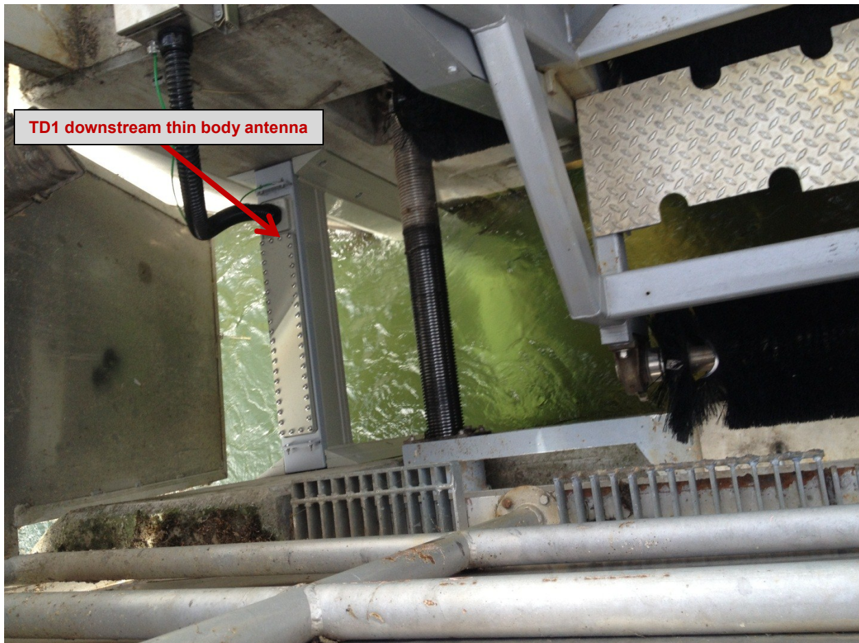
TD2 downstream thin body antenna

Because the antennas are only two inches thick, the antennas were able to be surface mounted into the counting window slots. Hydraulic disruption within the slots is minimized by constructing the antennas into a “speed bump” design. The thin body design also provides for a dramatically lower cost compared to installing standard body antennas that require extensive concrete remodeling and removal of metallic structure. The ferrite tile that makes the thin body antenna possible also allows it to be installed on metal surfaces.