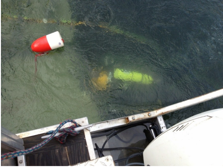
A diver places anchors to secure an antenna at the mouth of the Deschutes River.

Construction divers secured the 20' antennas to the substrate, basalt shelf and trenches, using a combination of wedge and duckbill anchors. Cable lengths were adjusted to accommodate ridges of basalt that run in an upstream-downstream orientation within the channel.